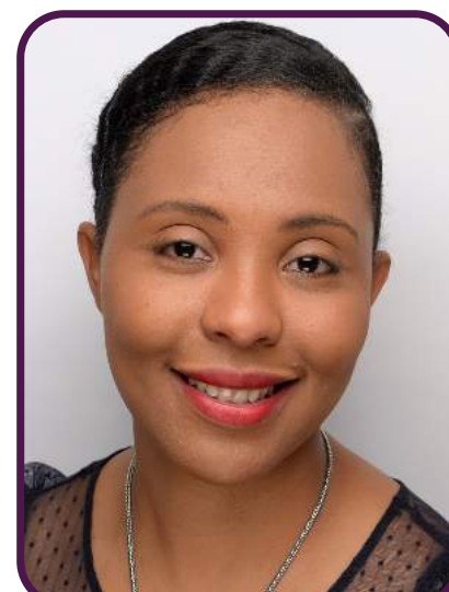
Philippa Wallace Nursery